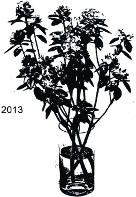
Flowering Spring Branch

March 21 April 18 May 16 June 20 July 18 Flower Show September 15 October 17 (Awards Night) November 21 Annual Meeting, January 16, 2013