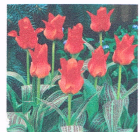
tulip Red Riding Hood